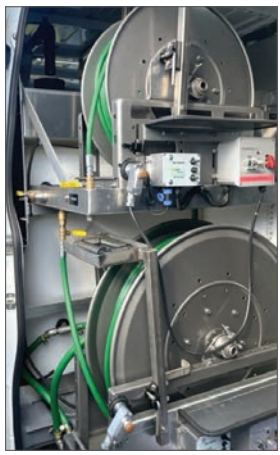
Remote Rewind & Additional Hose Reels